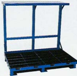
BS-SL (comes standard with drip pans)