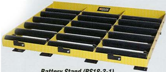
Battery Stand (BS18-3-1)