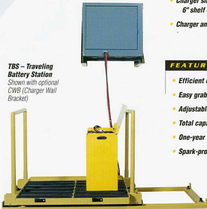
TBS – Traveling Battery Station Shown with optional CWB (Charger Wall Bracket)