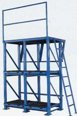
BS-DS (shown with optional ladder & catwalk)