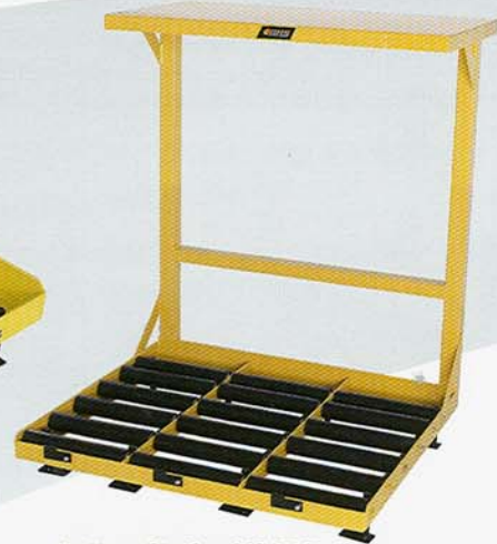
Battery Station (BS15-3)