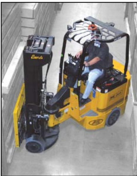
Awkward wide loads can also be handled effectively in narrow aisle using the 4-wheel Bendi with lift heights to 433-in (11M) and capacities to 4,500-lbs (2,045-kg).