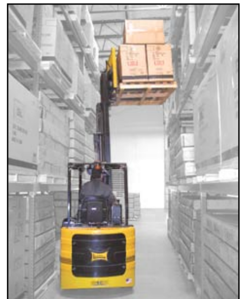
The Bendi offers the best visibility while stacking. The entire length of the load is visible to the operator during stacking. There is no rear end swing during stacking, so product and rack damage is eliminated.