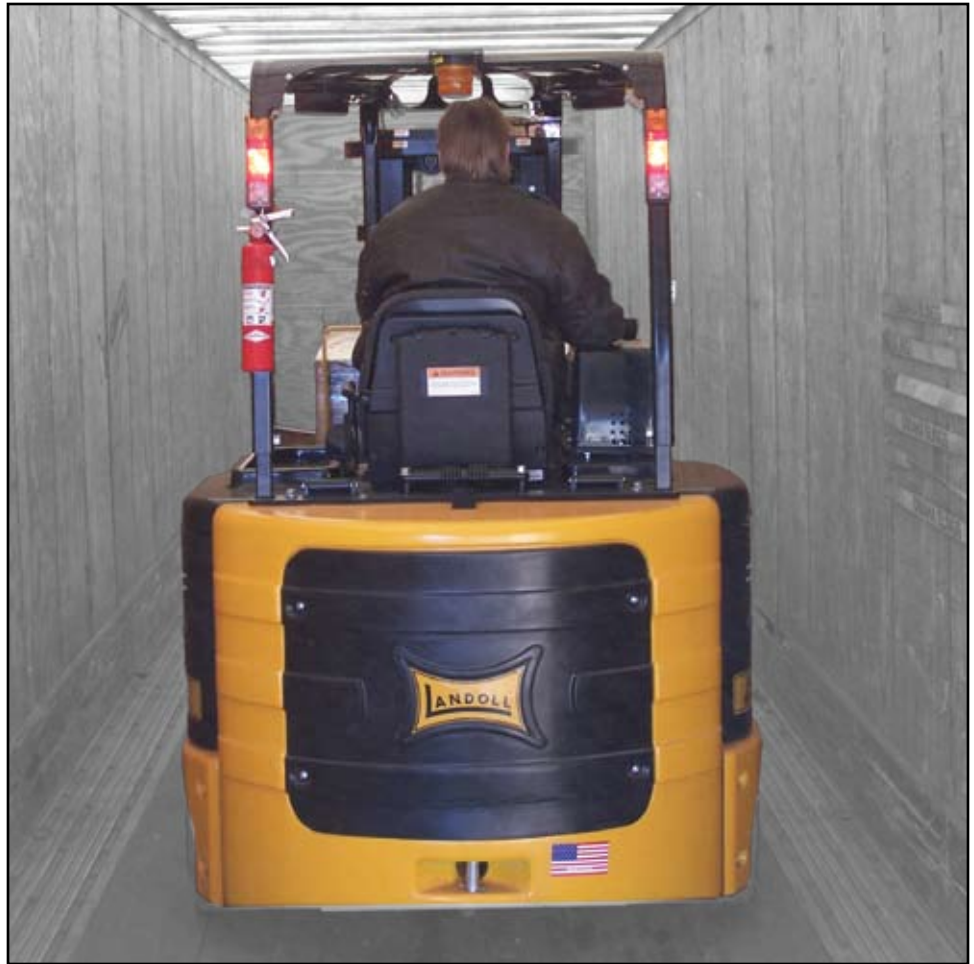
The multi-purpose 4-wheel Bendi Narrow Aisle Forklift is able to work the loading dock as effectively as a front loader, and still work in very narrow aisles. The driver can unload a highway trailer and drive straight to the storage location in a narrow aisle without staging or stopping.

Landoll has designed the Bendi to be the most space-efficient, versatile, productive, safe, and reliable forklift you can buy. It will meet the demands of any storage and handling operation. The Bendi's articulating front axle assembly allows the mast to rotate a full 180°. This feature enables the Bendi to operate in storage aisles as narrow as 5 ½-ft (1.68M), depending on load size and model. The Bendi is more than just a narrow aisle truck. With its front-loader configuration, it can handle a wide variety of jobs and eliminate the need for staging and supporting equipment. This gives the Bendi high stacking ability on standard warehouse floors, while allowing the low mast height necessary to work in highway trailers or travel through low doorways. Working in bulk storage and congested manufacturing areas, in pushback rack systems, rail cars, and outdoors comes easy for the Bendi. Load capacities range from 3,000-lbs (1,363kg) to 4,500-lbs (2,045-kg). The Bendi comes standard with an 11.8-in (300-mm) side shifter and can also be equipped with a variety of hydraulic attachments, such as a paper roll clamp, push/pull fork positioner, drum clamp, and a carton clamp to further enhance its versatility. With the Bendi, you'll discover that space efficiency and versatility result in unequalled productivity and maximum equipment utilization.