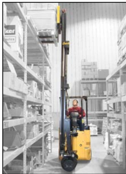
The 3-wheel Bendi offers a low cost Very Narrow Aisle solution. This truck, with lift heights to 360-in (9.14M), can stack in 72-in (1.8M) aisles. Its simplicity and ease of operation make the VNA truck of choice for warehouse application.