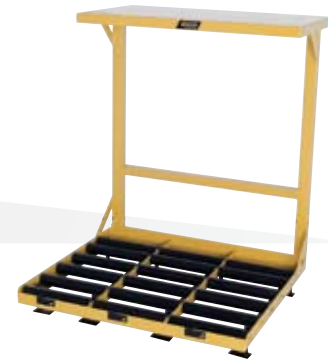
Battery Stand (BS15-3)