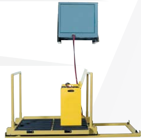
TBS – Traveling Battery Stand Shown with optional CWB (Charger Wall Bracket)