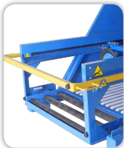
Battery Containment Bar

Lead acid battery instead of maintenance free battery pack