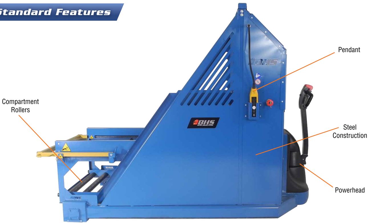
MBE side view