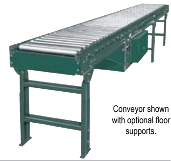
Conveyor shown with optional floor supports.